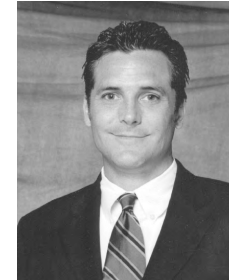
Mayor Thomas McDermott, Jr.

In 1995, the Hammond Water Works changed over to granular activated carbon rather than anthracite as a filter media to control taste and odor. We have continued using this filter media and are investing over Four million dollars on various improvements to our Lake Michigan based Filtration Plant. Hammond residents continue to enjoy the lowest water rates in the State of Indiana.