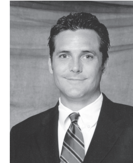
Mayor Thomas McDermott, Jr.

In 1995, the Hammond Water Works changed over to granular activated carbon rather than anthracite as a filter media to control taste and odor. We have continued using this filter media and are investing over Four million dollars on various improvements to our Lake Michigan based Filtration Plant. Hammond residents continue to enjoy the lowest water rates in the State of Indiana.